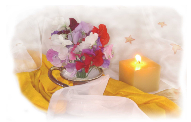
Prayer Space with appropriate symbols and music