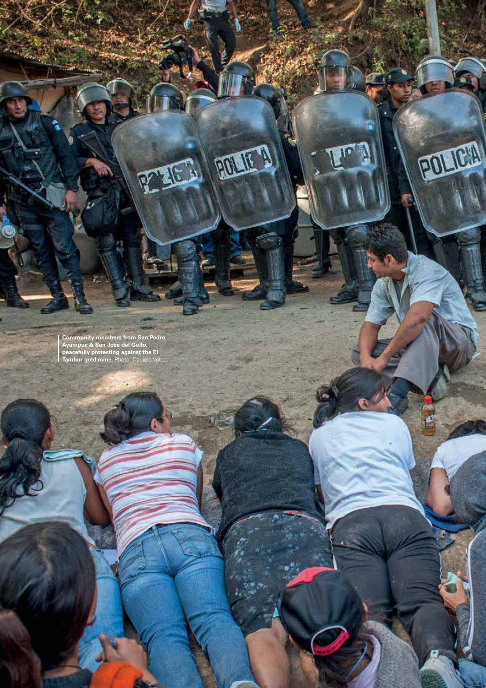
Community members from San Pedro Ayampuc & San Jose del Golfo, peacefully protesting against the El Tambor gold mine.