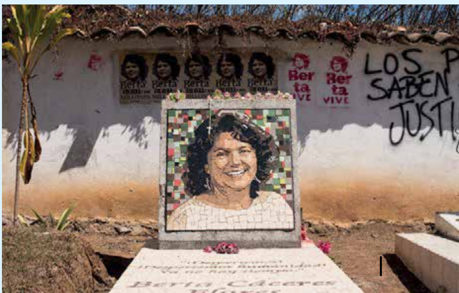
Berta Cáceres was killed in her home in March 2016. She co-founded COPINH and was an outspoken champion of the rights of indigenous people.

In November 2018, the court ruled the murder was ordered by executives of the Agua Zarca dam company, Desa, because of delays and financial losses linked to protests led by Cáceres. Cáceres, the coordinator of the Civic Council of Popular and Indigenous Organizations of Honduras (COPINH), was best known for defending indigenous territory and natural resources, but she was also a respected political analyst, women's rights defender and anti-capitalist campaigner. Those who masterminded her murder have still not been brought to justice and the license for the dam has not been revoked.