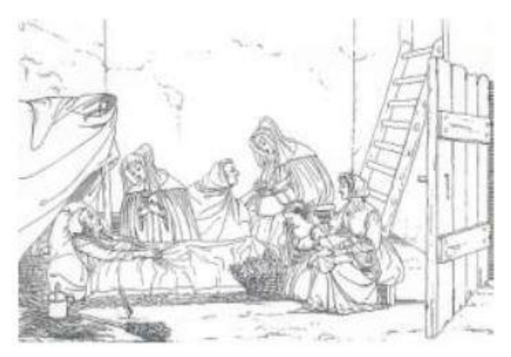
I was sick and you visited me

When the nurse in the Fever Hospital, Cavan resigned in 1885, the Board of Guardians placed an advertisement in the daily and local newspapers inviting applications for the post. There were no applications and repetitions of the advertisement yielded no contender. A probable reason for the lack of interest was the mayhem, which reigned, in the Cavan workhouse at that time. Neglect and abuse of the inmates was rampant, and the staff – who were themselves destitute, were appropriating provisions intended for the needy.