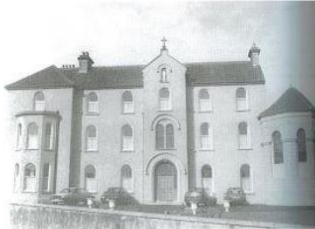
Convent of Mercy, Ballinamore, Co Leitrim