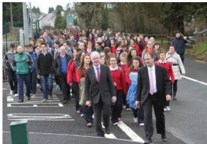
Staff and Students walk to the new Community School on 26 th February 2014

February 26 th 2014 was a historical and memorable day for the students and staff of the post-primary schools in Ballinamore, when the doors were closed for the last time in all three schools, Meánscoil