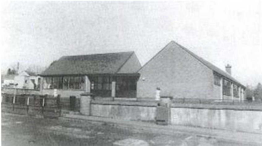
Junior Primary School, Ballinamore

Meánscoil Fatima dates back to 1950 when the Sisters of Mercy began secondary education and a new school building was opened on 6th December 1954. The school was to be involved in many changes in the intervening years to provide the best educational opportunity for students from Ballinamore and surrounding areas. The Vocational School was set up in 1941, St. Felim's College, diocesan school in 1962. All three Schools have played a very important role in second level education in the town over the last sixty years. In 1968, the three schools set up a unique system of co-operation by coming together with common enrolment and a sharing of teachers, resources and facilities, in effect operating as a single school, benefitting the pupils enormously.