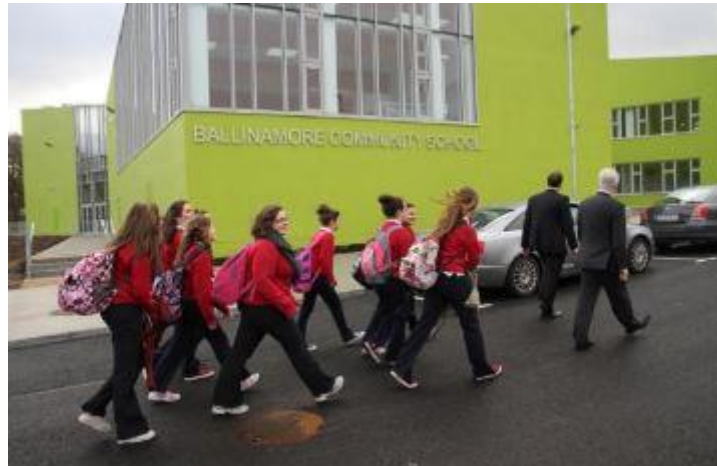
Entering the new Community School, Ballinamore

Fatima, St. Felim's College, Vocational School, and the school community moved to the new Ballinamore Community School. A ceremonial locking of the main door in each building took place, and staff and student from each school then merged to walk in symbolic procession to their new school.