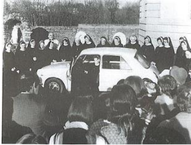
Presentation of a car by parishioners to mark Centenary in Ballinamore

Meánscoil Fatima dates back to 1950 when the Sisters of Mercy began secondary education and a new school building was opened on 6th December 1954. The school was to be involved in many changes in the intervening years to provide the best educational opportunity for students from Ballinamore and surrounding areas. The Vocational School was set up in 1941, St. Felim's College, diocesan school in 1962. All three Schools have played a very important role in second level education in the town over the last sixty years. In 1968, the three schools set up a unique system of co-operation by coming together with common enrolment and a sharing of teachers, resources and facilities, in effect operating as a single school, benefitting the pupils enormously.