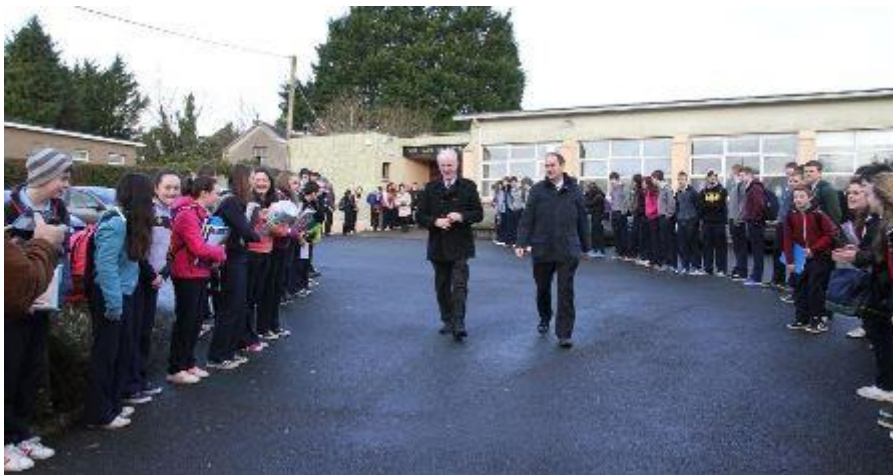
Leaving Meánscoil Fatima on 26 th February, 2014

An almost 40-year campaign by staff, parents, trustees, students and the community for a new school building yielded the desired result, when in 2008 the commitment to a new single site school to be built under the Public Private Partnership model was given. Work commenced on the new building in November 2012 and was completed in January 2014.