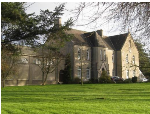
Convent of Mercy, Clara