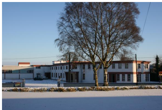
Sacred Heart School, Tullamore

In 1950 the Sisters decided to use part of their “farm” situated in Whitehall (about a 7 minute walk from the convent), to build a new second level school as the accommodation in the original Sacred Heart School was no longer adequate for the numbers enrolling. 1953 saw the new S.H.S. blessed and opened. It was considered a magnificent building but with the numbers increasing each year, rooms had to be added nearly from the start. 1967 saw the introduction of free education and the school became more cramped and crowded. Eventually, after much to-ing and fro-ing, in 1982 the Department of Education finally decided to help build a very big extension, which brought the school up to almost the size it is today with over seven hundred pupils http://www.ceist.ie/ceist_schools/view_school.cfm?loadref=139