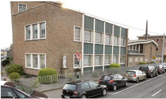
Novitiate block & Community Chapel, Tullamore

After consultation with Bishop Kyne, it was decided to go ahead with the building of a new convent rather than trying to renovate the old, which had grown too small for the number of Sisters living here. So, in 1960, two small houses owned by the Sisters on Convent Road, and the old secondary school were demolished and the first phase of the building started. This was a new Primary School – a three-storey building known as St. Joseph's. The Sisters, staff