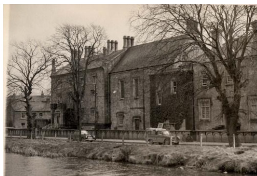
Original Convent, Tullamore

Lack of space hampered the work of education and on the 21st April 1838, the second anniversary of the Sisters coming to Tullamore, the foundation stone of a new convent was laid on the corner of Store Street and Bury Quay (now called Convent Road). The Sisters moved into the new convent in August 1841.