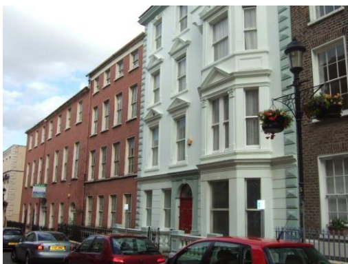
Convent of Mercy, Kells,