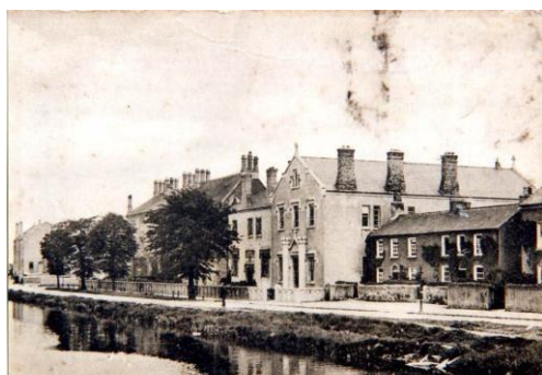
2 houses St. Joan's & St. Paul's; Sacred Heart School built 1910