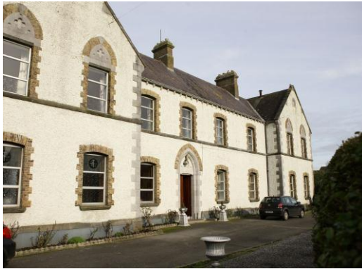
Convent of Mercy, Trim