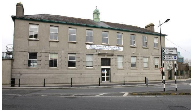
St. Mary's Youth Centre, Tullamore