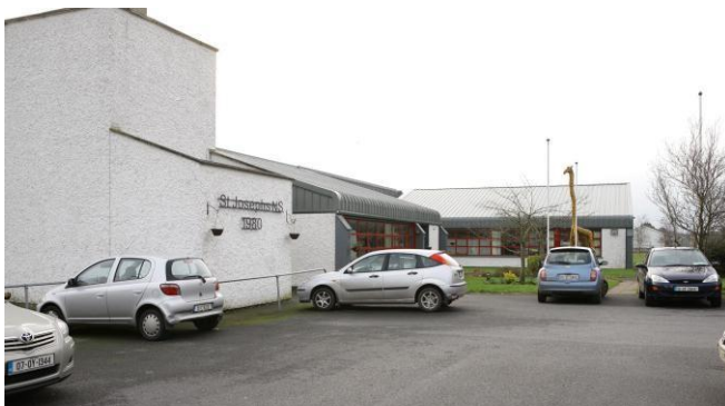
St. Joseph's School

and pupils moved in in September 1962. The demolition of Miss Pentheny's house and the additions added to it over the years were next to go and bit by bit all vestiges of the older buildings disappeared and in their place rose the edifice which is now the convent. The Sisters moved in by degrees and were in situ by the end of 1964. The Novitiate Block and the Community Chapel were completed in 1967.