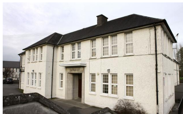
Scoil Mhuire, Tullamore