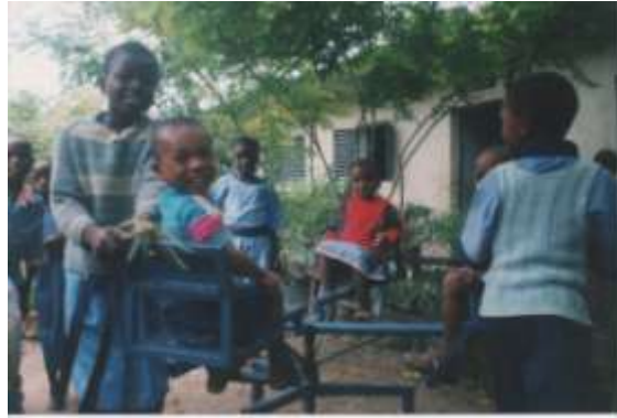
Pupils enjoying fun together

St. Peter's is situated in a village where children live near to the natural world. Ducks, hens, dogs, goats, sheep, cows and other animals roam free. Planting yams, Okra, Melons, Aloe Vera and Lemongrass in the school compound reinforces a love of the land in the pupils. Stories are woven around the children's experiences. Part of the method created is called ' Treble 3 ' which refers to 'Teaching, Testing, Teaching'.