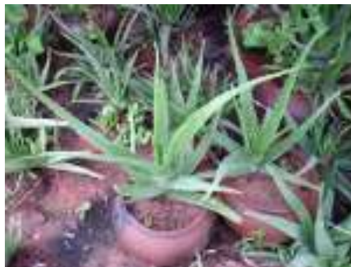
Aloe Vera Plant

St. Peter's is situated in a village where children live near to the natural world. Ducks, hens, dogs, goats, sheep, cows and other animals roam free. Planting yams, Okra, Melons, Aloe Vera and Lemongrass in the school compound reinforces a love of the land in the pupils. Stories are woven around the children's experiences. Part of the method created is called ' Treble 3 ' which refers to 'Teaching, Testing, Teaching'.