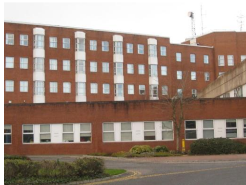
Completed new extensions, Regional Hospital, Mullingar 1988 and 1993-1994

In the 1930s, owing to the increase in the number of patients for hospital treatments, and to try to meet healthcare needs of the time, it was decided by the Local Government Department to erect a new County Hospital for Westmeath in Mullingar.