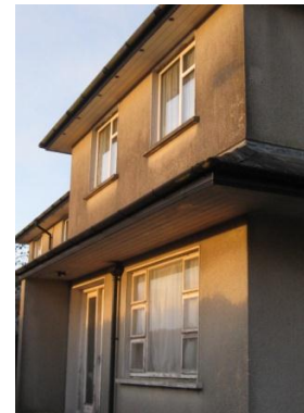
Residence where Sisters lived

In 1948 the president of St. Finian's College, Mullingar, requested the support and services of the Sisters of Mercy. For thirty four years from 1948 – 1982 there were always two Sisters in ministry in the college. One Sister was a registered nurse, and served as 'Matron' to the students. The other Sister was skilled in catering / housekeeping. She managed the domestic staff and looked after necessary provisions.