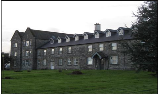
St. Mary's Hospital (former Workhouse/County Home)

In 1896 it was decided that the Sisters of Mercy should establish a community in the Workhouse in Mullingar.