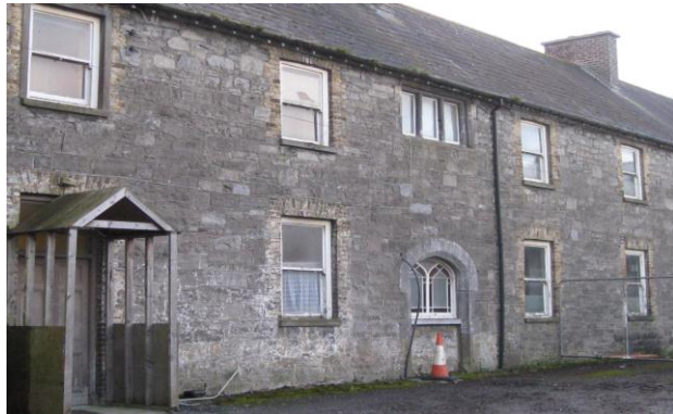
Entrance to St. Mary's Chapel

The medical officer, together with the Sisters of Mercy and their lay staff, worked untiringly for the welfare of the patients in their efforts to improve conditions at the time.