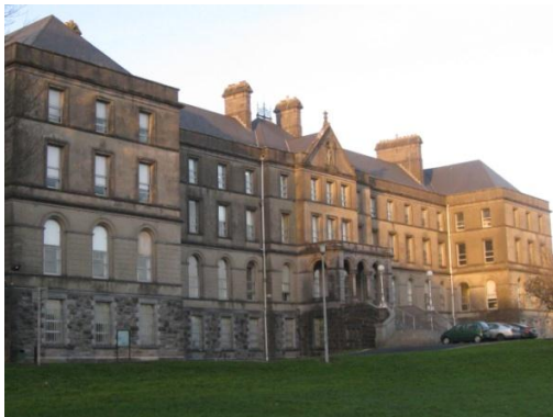
St. Finian's College, Mullingar