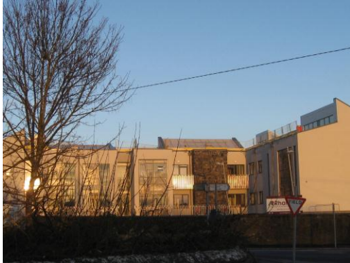
The new St. Mary's Hospital, near completion 2011

A Sister was appointed as manager to this upgraded unit and served tirelessly in the post until November 2009, when she retired. She was the last Sister of Mercy serving in St. Mary's.