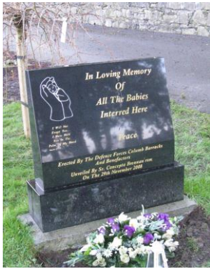
Holy Angels Memorial, financed by the Defence Forces, Mullingar

In collaboration with hospital administration, the viewing room and hospital oratory were re-designed.