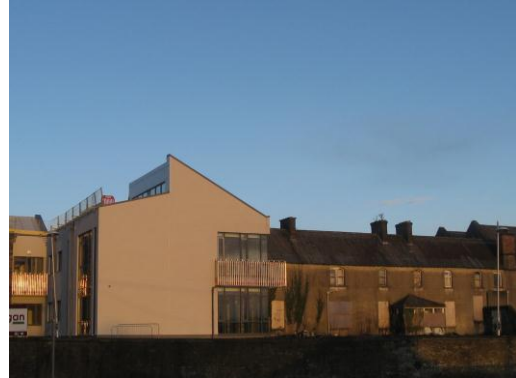
St. Mary's old Convent – now used as a Laundry