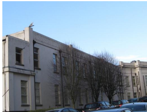
General Hospital: 1936 Ward 1 & 3 and Maternity Central 2011

Mercy healthcare ministry continued to develop and expand. The Sisters excelled in their ministry in surgical care and paediatric specialities. One of the last serving Sisters of Mercy retired in 2010.